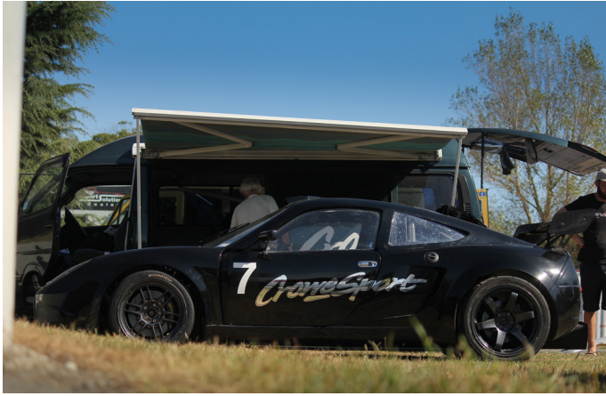
The CroweSport 818 Coupe - calm before the storm