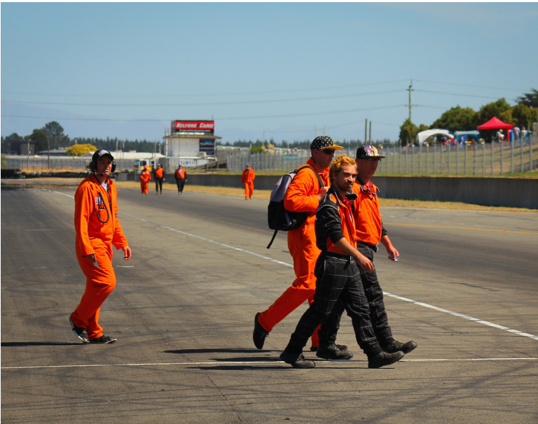
Out in the thick of the action, or behind the scenes, every contribution is greatly appreciated by the Canterbury Car Club,