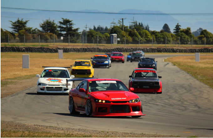
Club Saloon field heading into the Hairpin