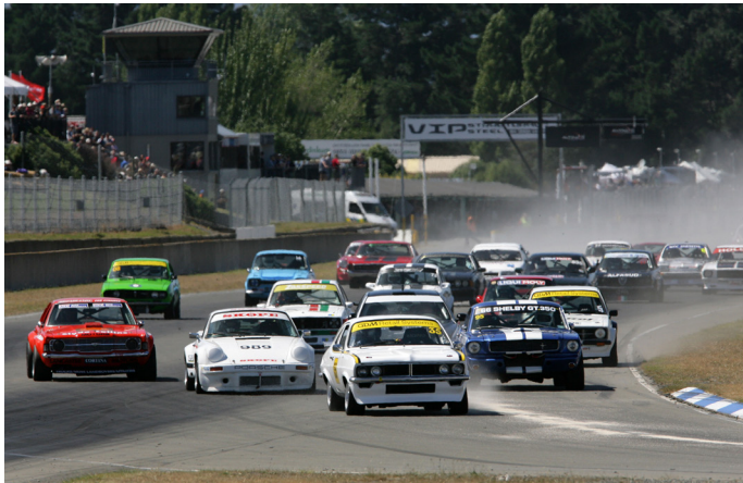
The Ron Silvester Saloon grid battling for position as they head into turn 1