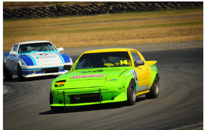
RX7s getting serious track time in before the Super Weekend