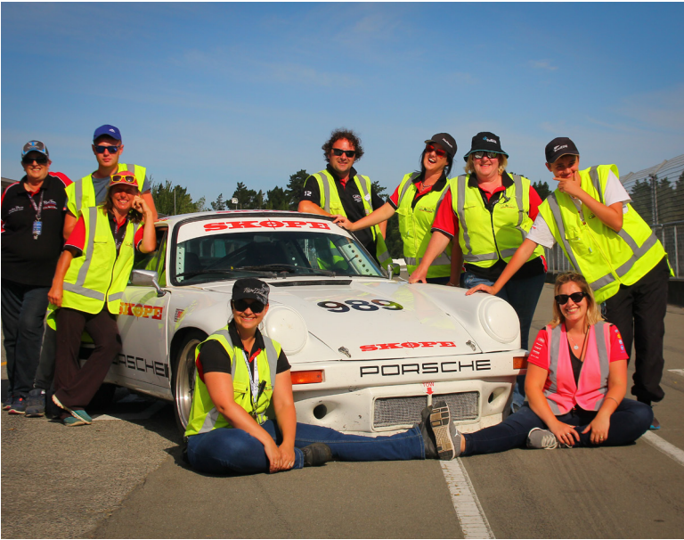
A tribute to our wonderful volunteers, who provide so much energy and enthusiasm to every event.