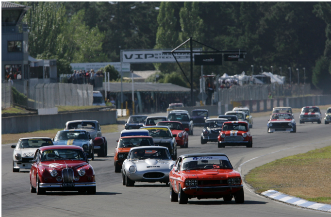
Harold Heasley Saloons heading in to turn 1