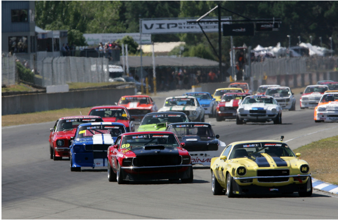
Mainland Muscle Cars making their way down the front straight