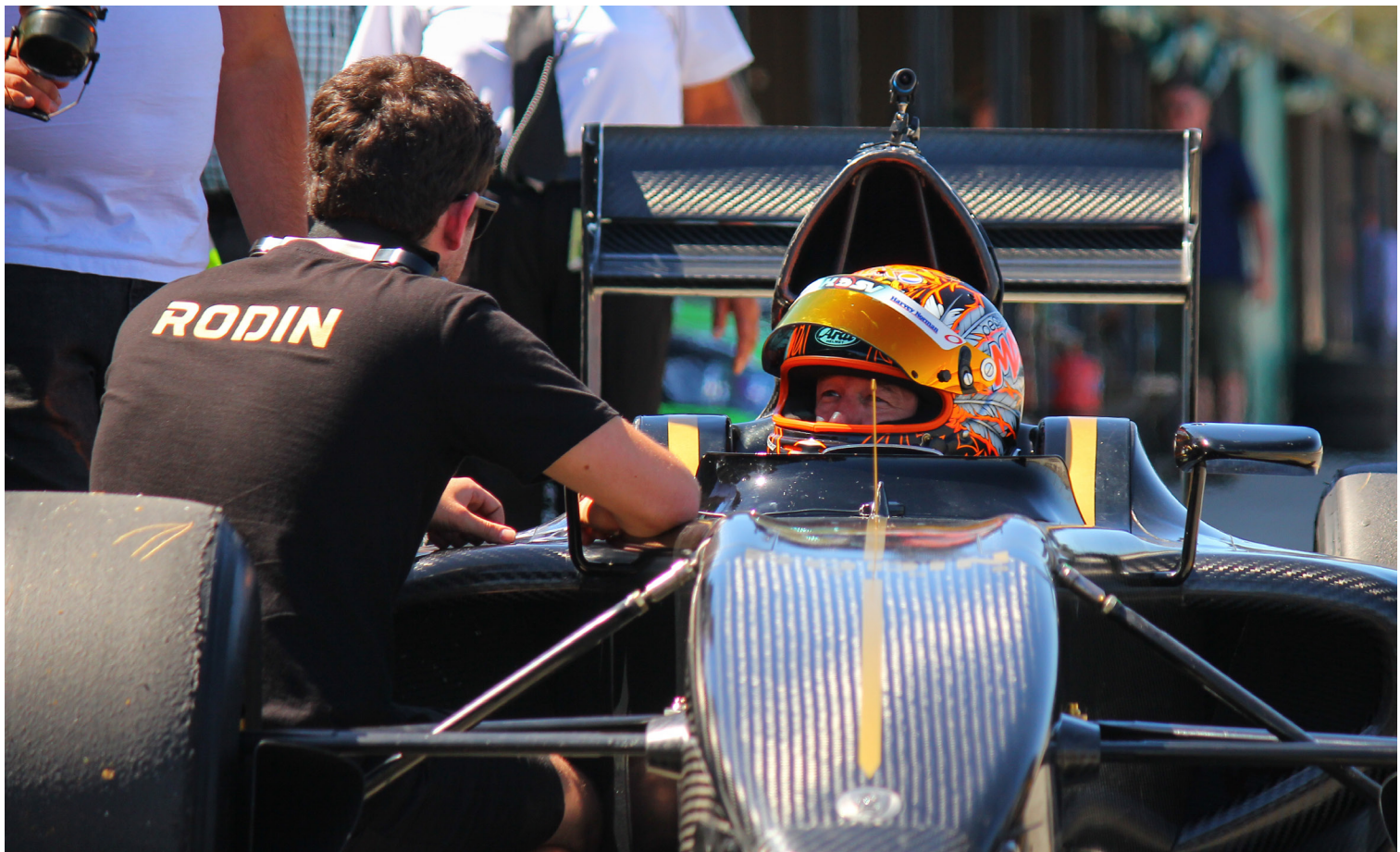
Greg Murphy talking to the Rodin engineer after his demonstration lap