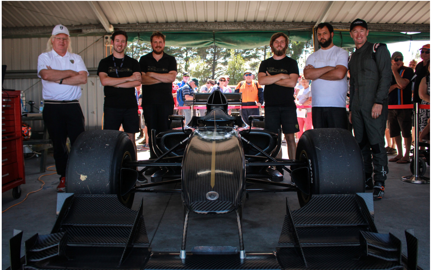
The team from Rodin Cars