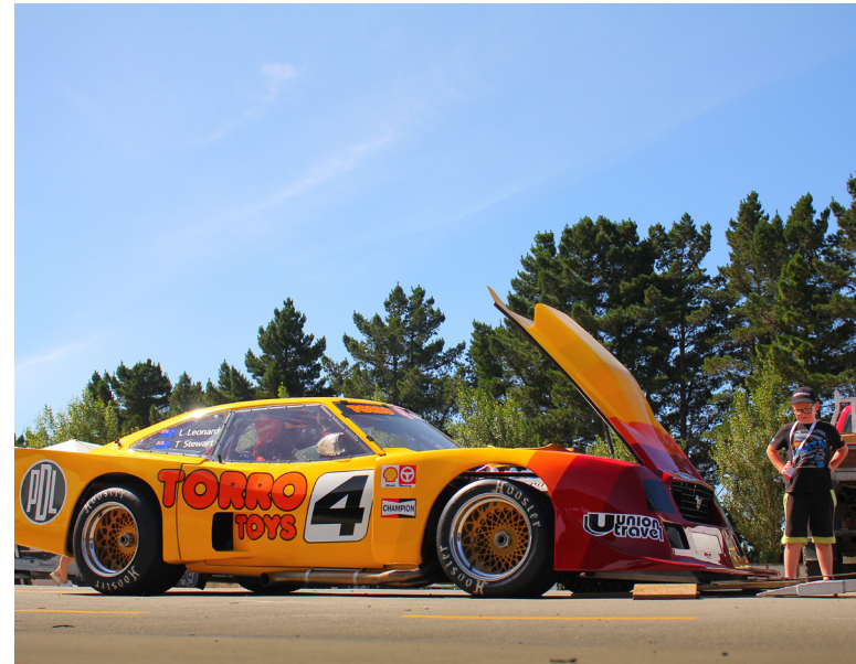
by the thousands of motorsport fans who return year after year, and the next generation being inspired.