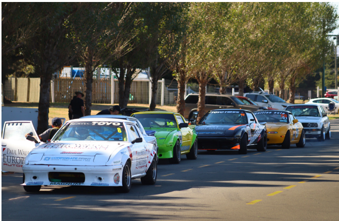
A shady lane providing a welcome respite from the heat