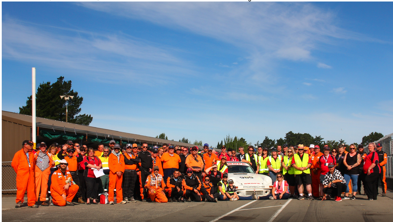
A huge thank you to our amazing team of volunteers