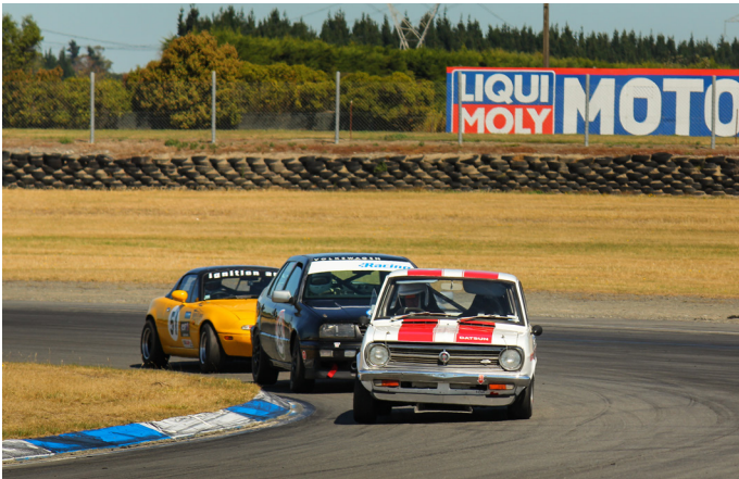
A Datsun, a Volkswagen and a Mazda walk into a bar....?