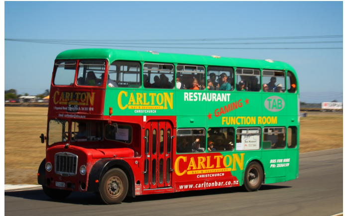
The double decker bus takes some keen spectators around the circuit during the lunch