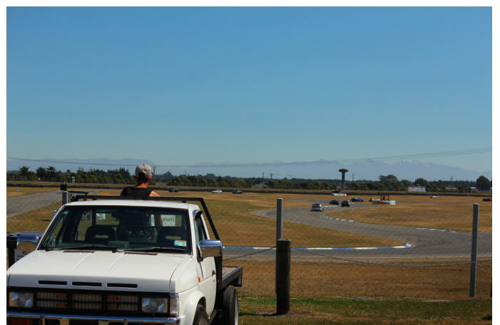
How could the view be any better?