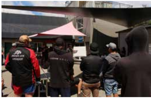
Driver's briefing - safety first, always.