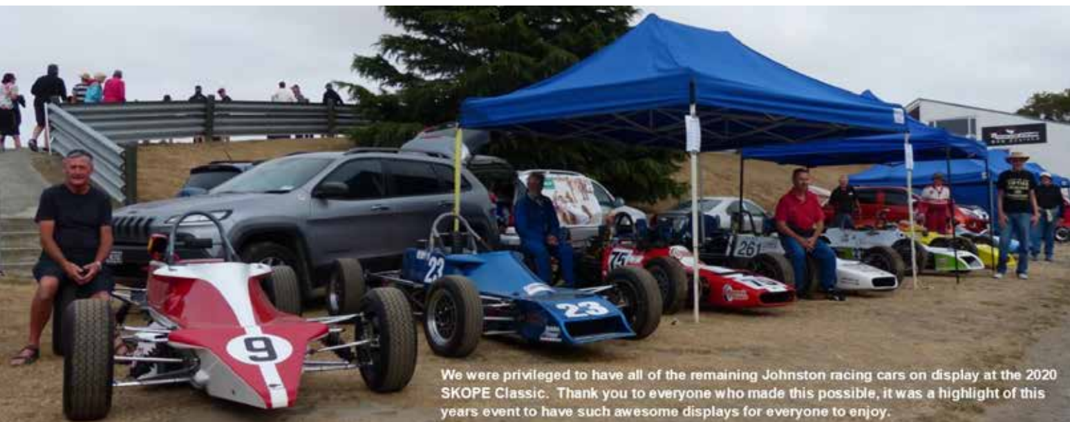
We were privileged to have all of the remaining Johnston racing cars on display at the 2020 SKOPE Classic. Thank you to everyone who made this possible, it was a highlight of this years event to have such awesome displays for everyone to enjoy.