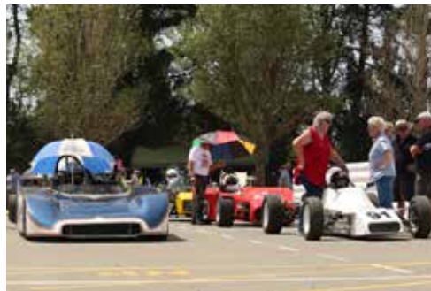
Shade was a highly-sought commodity all weekend