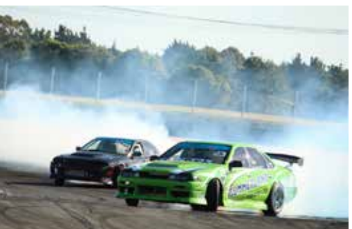
#132 Zac Palmer Vs #23 Glen Pupich