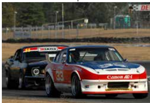
#33 Ryan Low in the Datsun 240Z Scarab looking for some distance from #11 Angus Fogg in the 1970 Ford Mustang