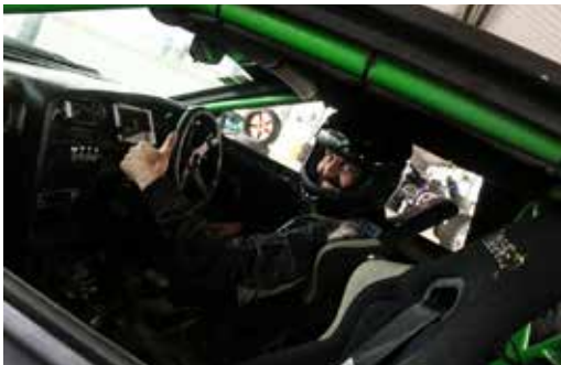
Good to Go!