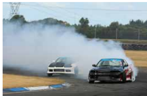
#99 Rob Neeley Vs #132 Zac Palmer