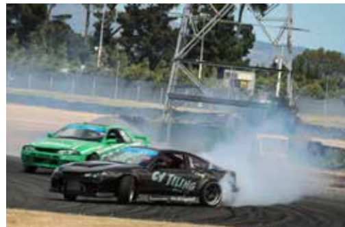
#472 Brad Knight Vs #4 Corey Farrant