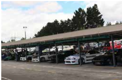
An awesome turnout of competitors, crews and spectators had the pit garages full to capacity