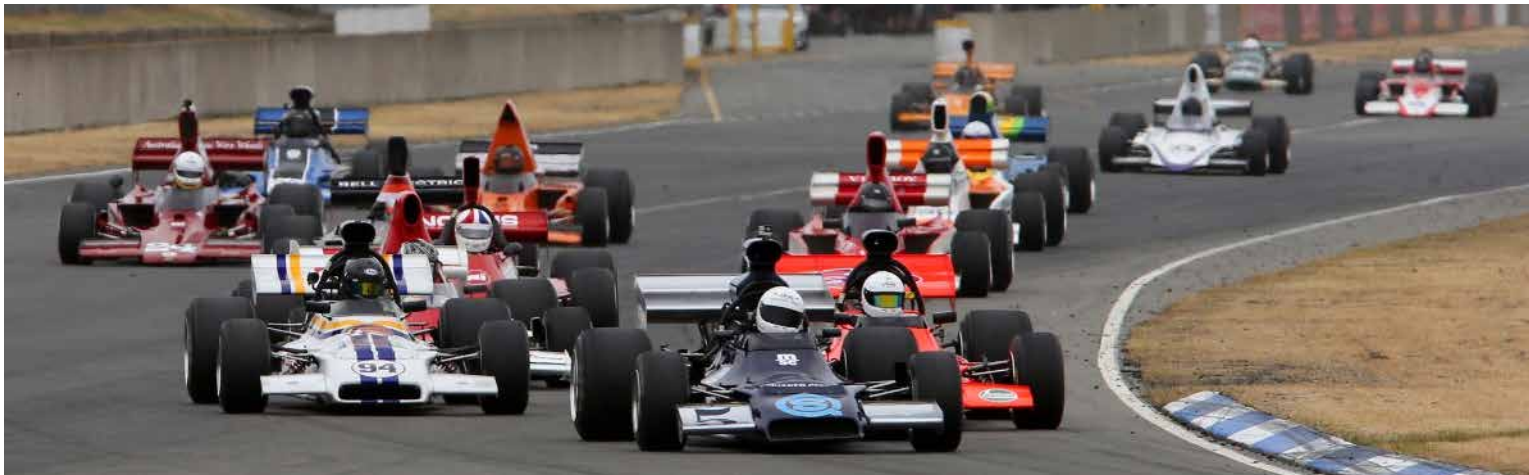
F5000 Class thrashed it out at full throttle over the weekend of Skope, thrilling the crowds.