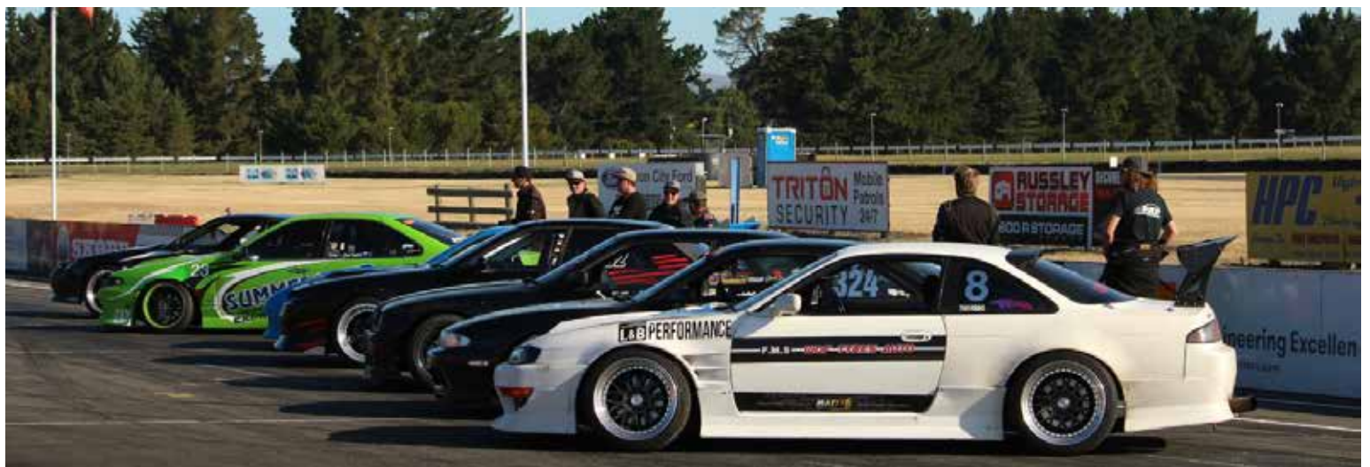
Round 3; Pro Drift and Development Series top guns front up for the spoils