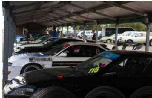
Drift Round 3, preparations complete, ready to roll out